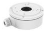
DS-1280ZJ-M Junction Box