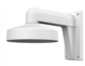
DS-1272ZJ-110-TRS Wall Mounting Bracket