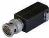
DS-1H18 Video Balun